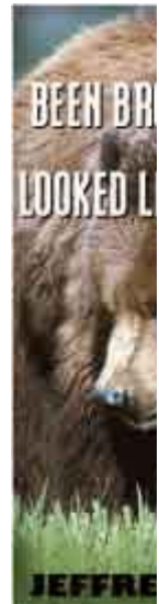
Been B It Looked The Pol by Je