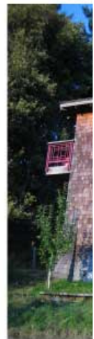
A Red on tl Click her