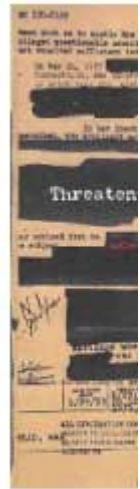
Threatenin McCarthy Surveillance By Da