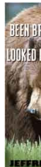
Been Br It Looked The Pol by Je