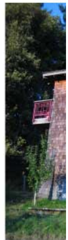
A Red on the Click her