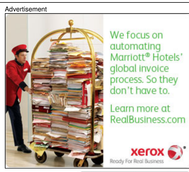
Print Powered By | Format Dynamics |

A message seeking comment on the arrests left for a supervisor at the jail was not immediately returned on Monday.